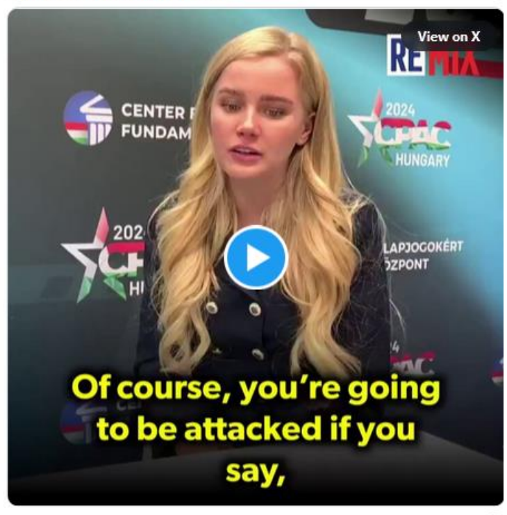
5:05 p.m. · June 30, 2024

The attempt to exploit European youth for this project of cultural self-dissolution is particularly perfidious. With well-sounding phrases like "cosmopolitanism" and "global solidarity" an entire generation is being seduced into denying their heritage and alienating themselves.